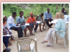
First time in Ghana