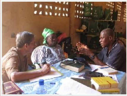
Emperor taking a case

endeavour wholeheartedly. If you feel that you may like to be involved in some way, we welcome the gifts and skills you can offer. Please do get in touch.