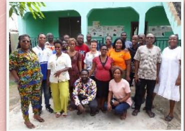
Certificate Group 2025