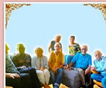
The UK based team at a recent meeting

GHP introduced the Practice Grant in 2023, the aim to provide a helping hand to practitioners wanting to move from informal grassroots community homeopathy to building sustainable clinics of their own. There are many costly official procedures that are required before a practitioner can legally begin a clinic. However, the Practice Grant has provided helpful support with this in the initial start-up stage. Currently, 13 practitioners have received the grant, five of whom have now completed and have gone on to build sustainable practices each in their own way. One is creating a new