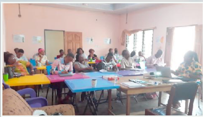
Students at the Certificate Course