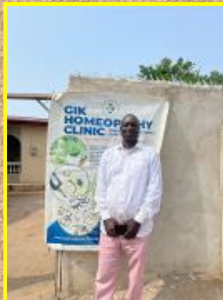
GASIKA IN ABOR