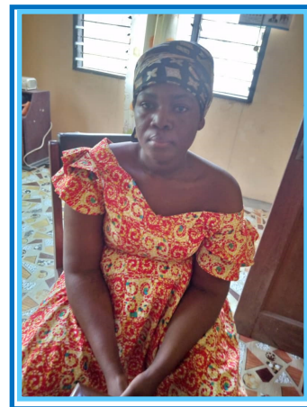
YOUNG WOMAN RECOVERS AFTER TREATMENT WITH IPECAC & SEPIA

In the morning she was taken to see a midwife. The midwife found no more traces of placenta in the uterus. Ipecac and Sepia had cleared all remaining matter.